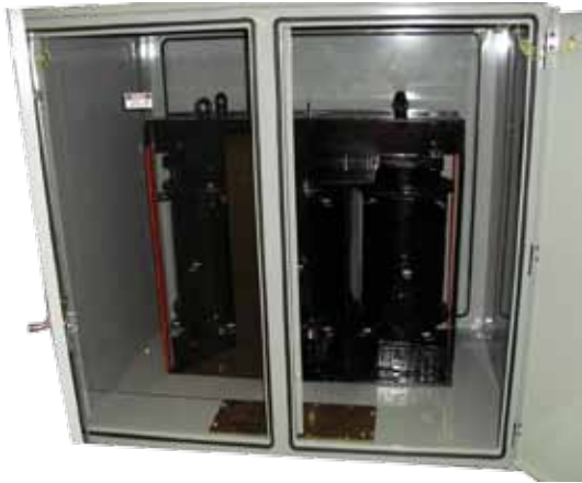
THREE PHASE ENCLOSED MOTOR STARTER AUTO TRANSFORMER