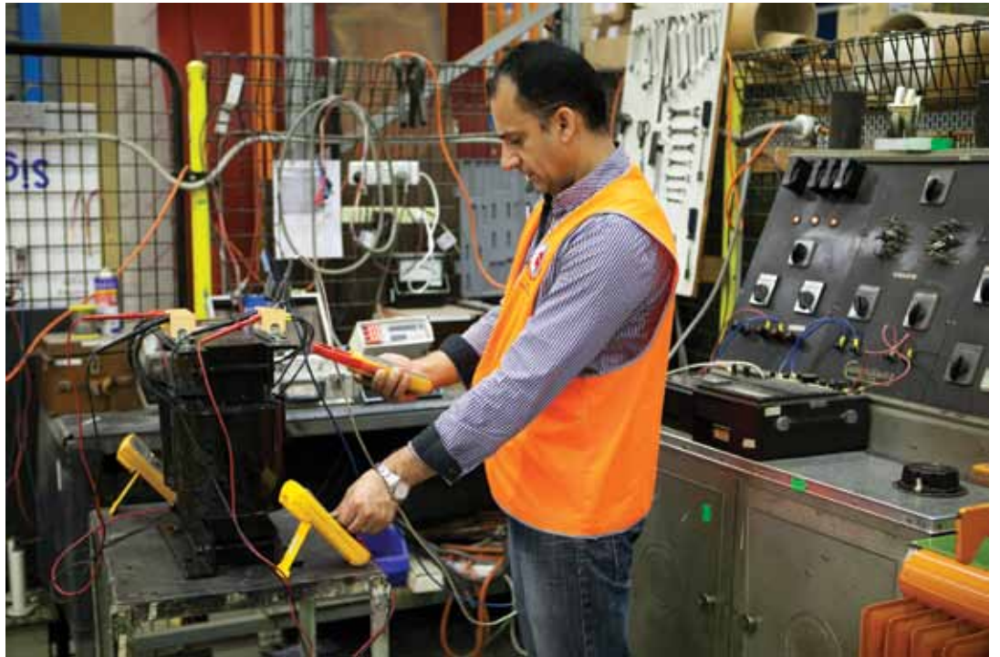
Testing of Single Phase Power Transformer