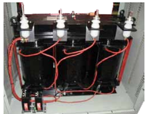
THREE PHASE ENCLOSED TYPE NEUTRAL EARTHING TRANSFORMER (ZIG-ZAG) COMPLETE WITH HV BUSHING AND CT