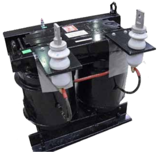
SINGLE PHASE OPEN TYPE NEUTRAL EARTHING TRANSFORMER (ZIG-ZAG) COMPLETE WITH HV BUSHINGS