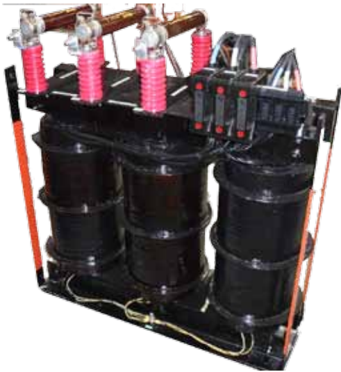
THREE PHASE 11KV POWER TRANSFORMER COMPLETE WITH HV HRC FUSES