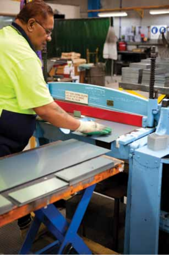
Cutting core strips and yokes