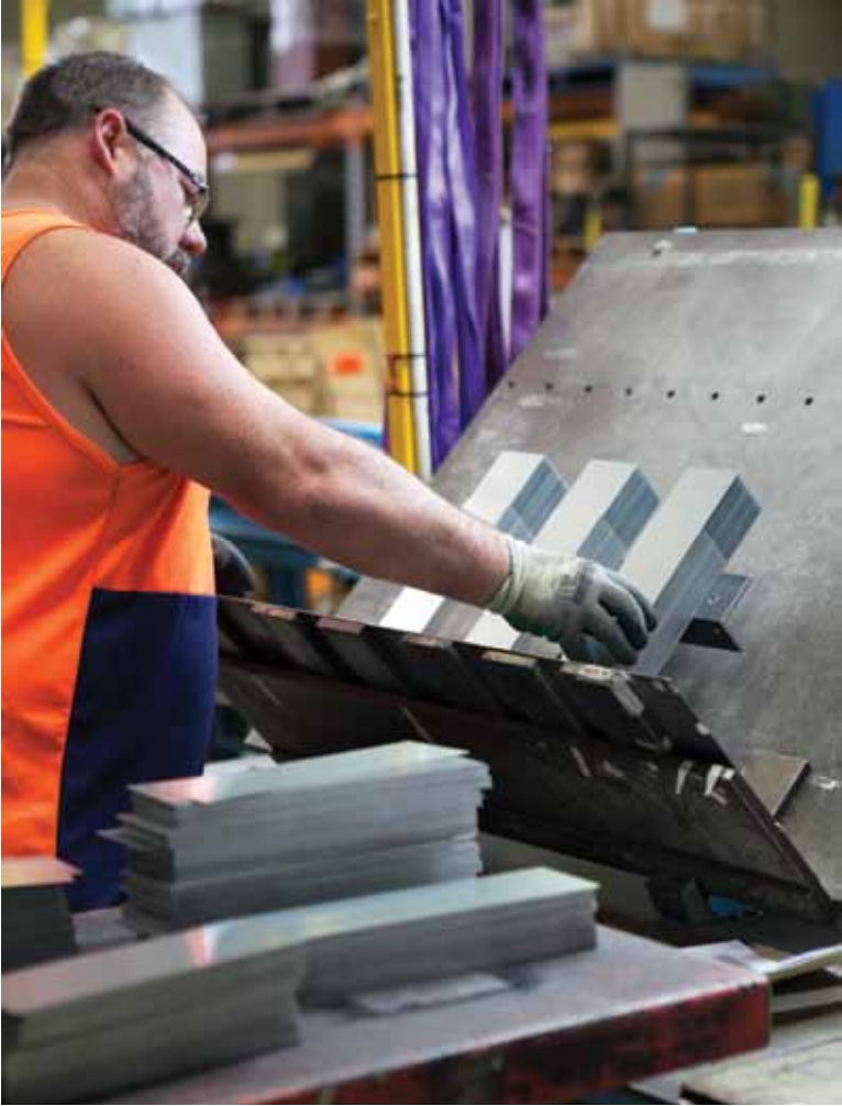
Building 3 Phase Core